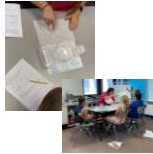
Summer Seals testing different types of water

This past week, students read about types of water, animals found in and around water, and learned about how we can identify water based on its attributes. We have had lots of fun along the way. This is only the beginning of our summer journey, and it is off to a great start! Thank you for following our progress as we read, create, explore, and plunge into learning!