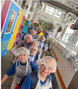
Summer Seals making chocolate!

On Thursday, June 29th the Summer Seals had the chance to visit Hershey and see many exciting things at Chocolate World. Seals got to learn more about Milton S. Hershey as they toured through downtown Hershey on a trolley. The trolley ride was complete with assorted chocolates!