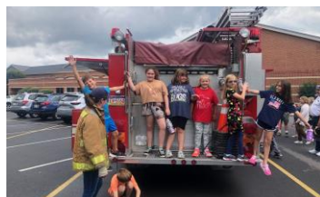
Summer Seals on the back of the fire truck.